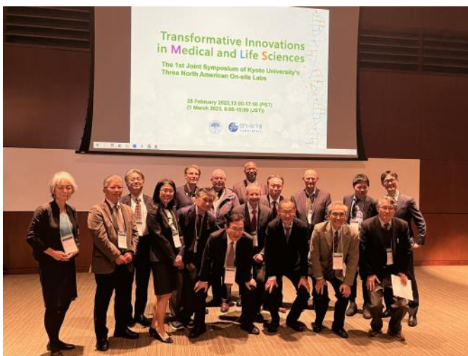
1st Joint Symposium of Kyoto University's North American On-site Labs