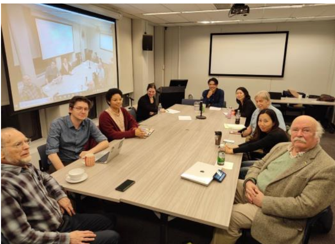
Discussion of my work-in-progress at Columbia University

I think I am gaining the skills to situate a research topic in the broad context of the discipline of history and beyond in society. As I see it, historical scholarship in Japan is generally committed to empirical analysis far more so than in the US. That sometimes can lead to the compartmentalization of the discipline into narrow sub-fields with little regard for what really matters. I am hoping to use the skills I learn here to intervene in this trend in Japanese history in Japan and generate conversations on the significance of the historical discipline among historians across different subfields. My status as a former JSPS fellow will probably be helpful, as I imagine it would carry considerable weight in Japanese academia.