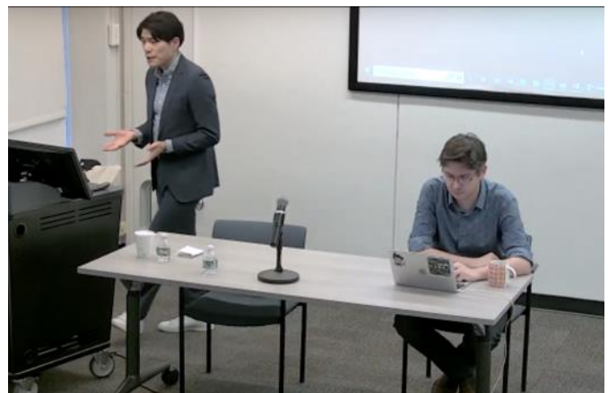
Presentation at the Weatherhead East Asia Institute, Columbia University