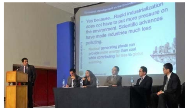
Panel discussion at Guanajuato University

With all of these developments, we expect further progress in Japan-Mexico academic exchange, including the exchange of students and researchers between HU, IPN, and the University of Guanajuato.