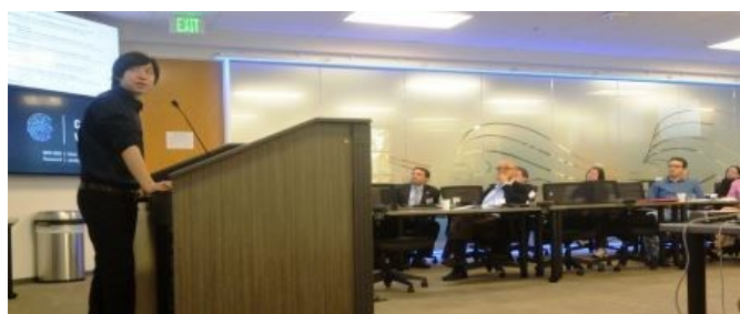
the UCI-Tsukuba Science Partnership Conference held at UCI

A showcase event highlighting this growing partnership was the joint UCI-Tsukuba Conference on the theme “Exploring Complex Systems from Human Biology to Exercise Sciences” held at UCI in December 2015. The 3-day conference,