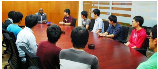
Study visit of University of Tsukuba Engineering students at UCI