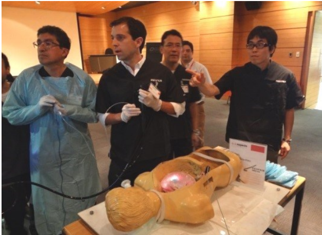
State of endoscopic guidance at the University of Chile

Thirdly, in January 2010, TMDU, Clínica Las Condes and the Ministry of Health of Chile (MINSAL) signed an international agreement to implement the “National Colorectal Cancer Screening Project” (PRENEC) with the aim of reducing colorectal cancer mortality rates in Chile. That year, TMDU also established the Latin America Collaborative Research Center (LACRC) which is one of three TMDU Overseas Satellite Offices together with the ones in Ghana and Thailand. LACRC is located within CLC and currently operates with one professional endoscopist from TMDU. Over the years, TMDU has dispatched several experts to Chile. As a result, Chilean professionals have been trained in endoscopic techniques and pathological diagnosis by TMDU experts, taking advantage of Japanese knowledge and technology, and thus creating a precedent in terms of diagnosis and effective treatment for colorectal cancer.