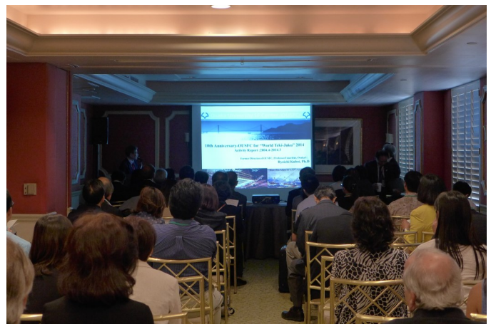
10th Anniversary Celebration of Osaka University North American Center