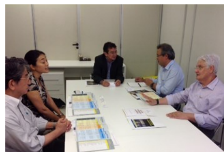
Meeting with UFPE