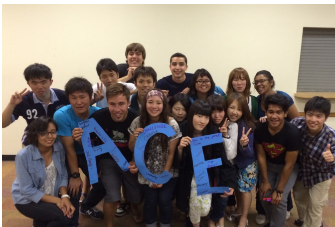
Advanced Culture and Education (ACE) Program

The Step-up And Re-learning (STAR) Program began its first year with five graduate students from FIT, which took place in California over eight days. The purpose of this program is to educate students about globalization, leadership, and entrepreneurship through the perspectives of young engineers and well-known figures from top technology companies, startups and universities in California, especially in Silicon Valley. Their mission was to research and expose themselves to advanced technology to create a more interconnected world and learn to become a global contributor not only to their home country, but to other nations as well. They visited companies such as TESLA, Cisco, and Hewlett-Packard (HP), and the labs of Santa Clara University to attend presentations and meet those who create innovative technologies with real world applications. From these tours, the students were able to gain expert career advice and learn about the importance of having a global mindset, working with different fields of concentration, and being motivated to further their own interests. As a result, they became inspired to plan and challenge themselves to achieve their goals for future careers as the next generation of young innovators.