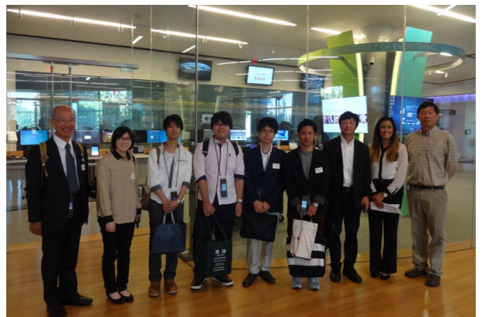
Step-up And Re-learning (STAR) Program