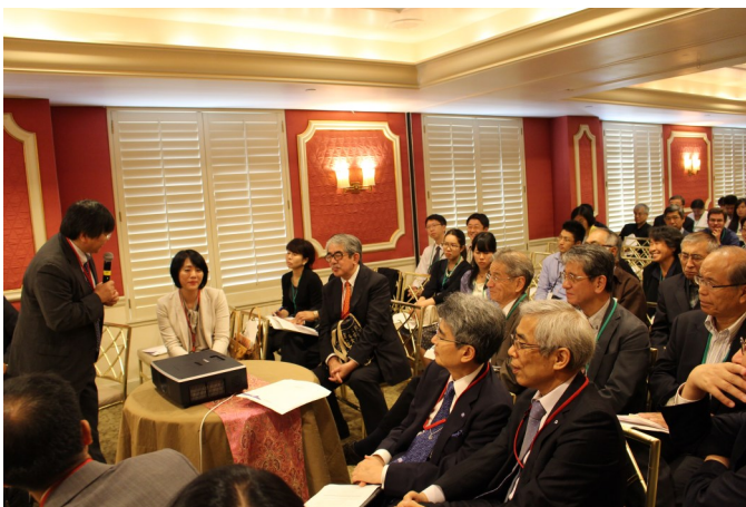
Go Global!! Symposium of the Center for Global Health, Osaka University Hospital