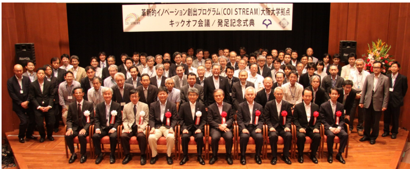
Inauguration Ceremony of Osaka University COI Site on July 2, 2014

*This program is positioned as one of the main programs under the Center of Innovation Science and Technology based Radical Innovation and Entrepreneurship Program (COI STREAM) which is funded by MEXT and jointly operated by MEXT and Japan Science and Technology Agency (JST). It is aimed at realizing an ideal society by promoting challenging and high-risk R&D with the three following visions: Smart Life Care and Ageless Society, Smart Japan and Active Sustainability.