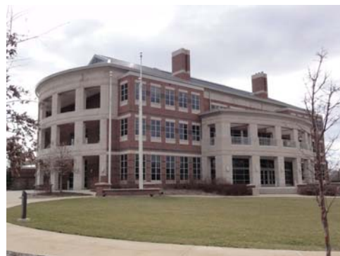
Alice Campbell Alumni Center