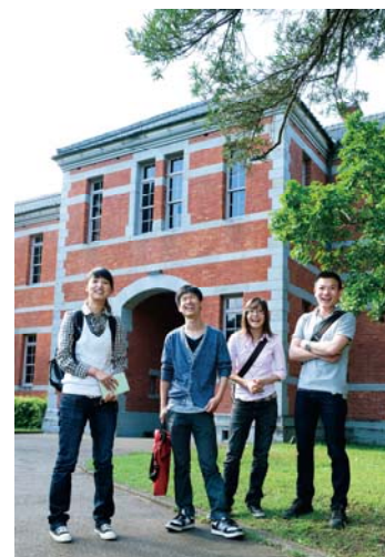
Students from China, Japan, and Lao