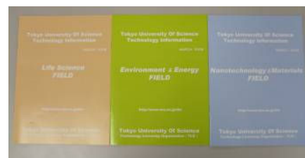
Fig.1 Tokyo University of Science Technology Information