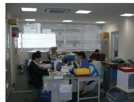
TUS int'l division

• As I mentioned above, our office is now along the Kagurazaka.