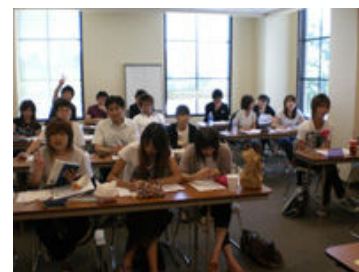
Fig.2 Summer program in UCSC

The SF office has also been progressively engaging in active communication and data collection in Silicon Valley, which is the center of industry-academia-government collaboration in the United States. In this way, the SF office has been participating in joint international research between industry and academia as well as in the global development of technical transfer.