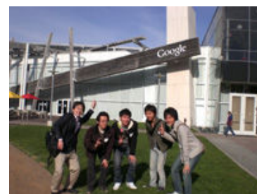
Fig.3 Corporate visit in the Silicon Valley