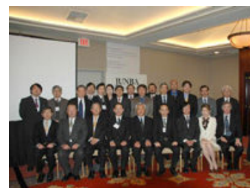
Fig.4 JUNBA 2008