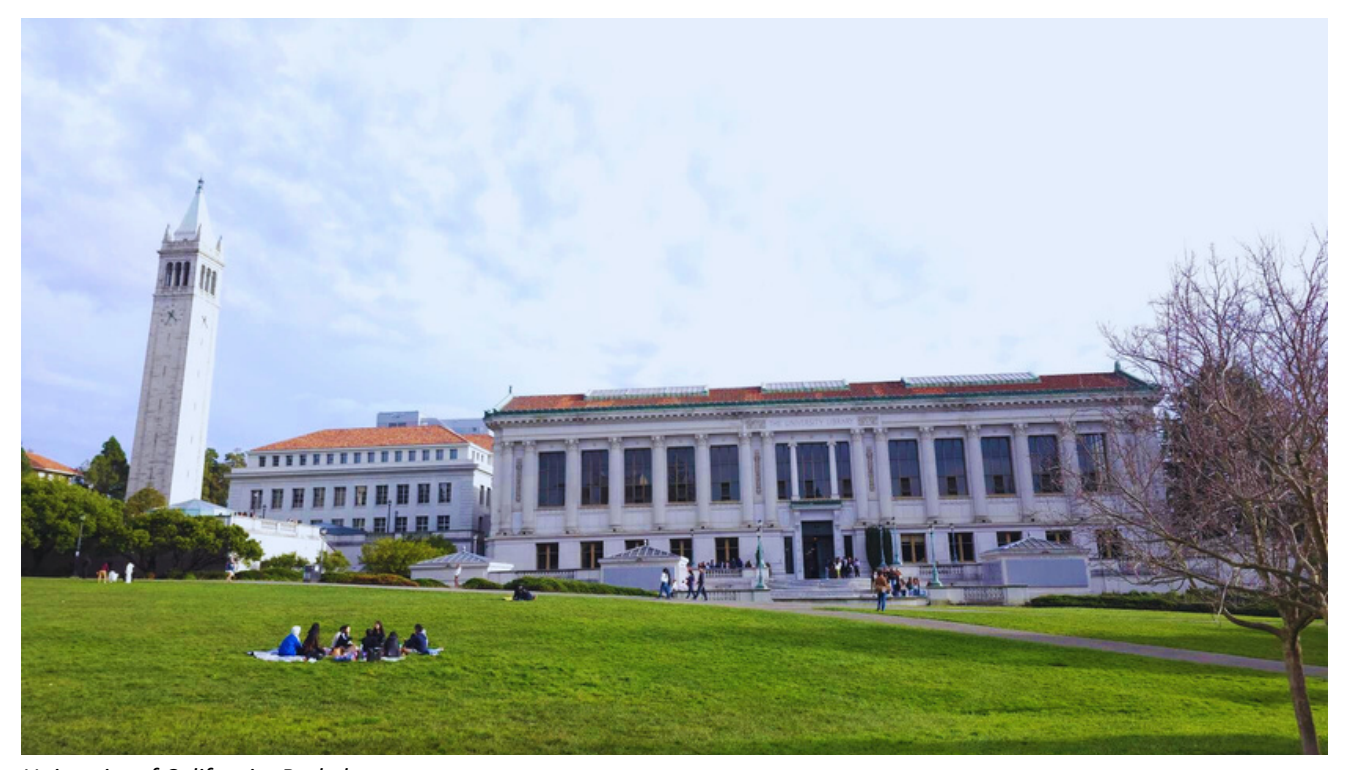
University of California, Berkeley