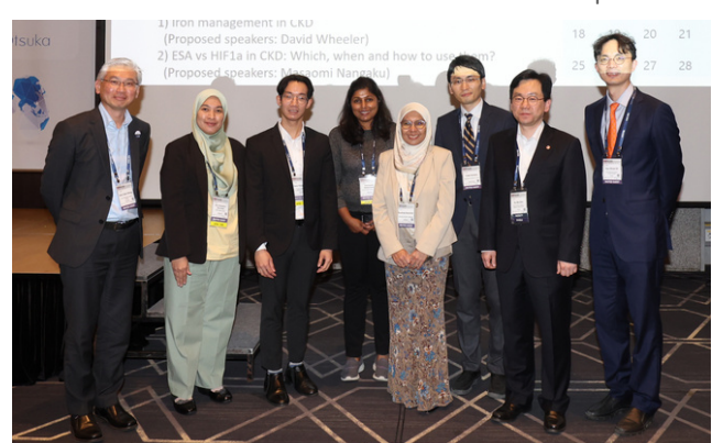
KSN/APSN Joint Symposium on interorgan crosstalk held in Seoul, Korea (2023).