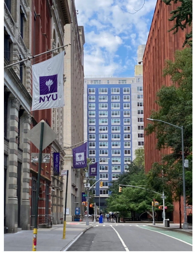
Pic.1 Buildings of New York University (NYU)

Another reason is that the backgrounds of researchers and students in the U.S. are generally very broad. The intimate interactions with them will enable me to cultivate new ideas that I would never come up with