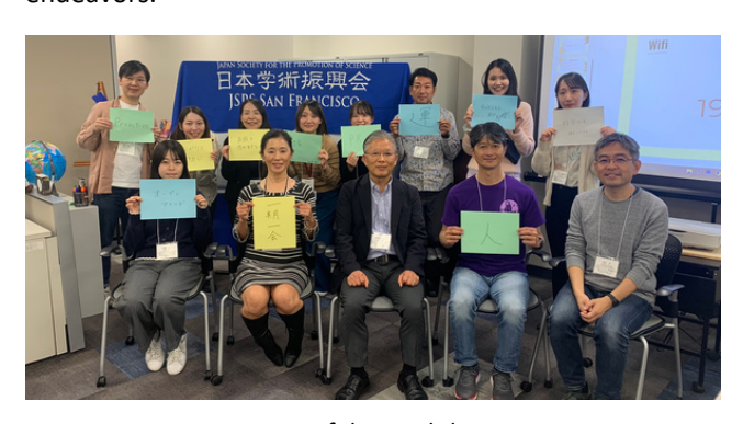
1st Day of the Workshop

During the afternoon discussion session, participants candidly shared their observations post-arrival in the US, differences in work culture between Japan and the US, challenges faced, and concerns. Looking ahead to the after part of the training and post-return to Japan, attendees made pledges on how they intend to leverage their American experiences in their professional endeavors.