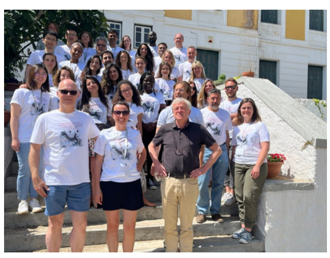
EMBO | FEBS Lecture Course held in Spetses, Greece (2022).

Although I have spent most of my career in the Tokyo metropolitan area, I noticed that, with sufficient resources, researchers do not necessarily stay in the most populous regions of a country. St. Louis provides a nice and affordable living environment with a warm and friendly community that embodies the pioneering spirit of the Midwest.