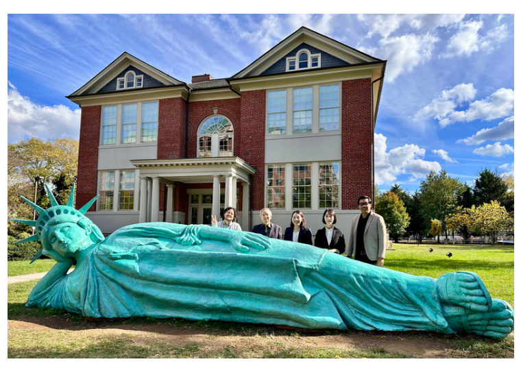
Members of JSPS Washington Office

In additional news, the Washington Office is the Secretariat of the U.S.-Canada JSPS Alumni Association and its regional Chapters. In recent years, the <u>Capital Chapter</u>, The GULF States Chapter, and the <u>Quebec Chapter</u> have been established. There are plans to form more chapters in various regions in the future.